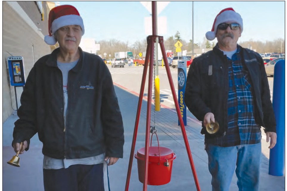
Employees at Crowder Industries in Neosho ring bells for the Salvation Army red kettle campaign in December.

The workshop has partnered with other community organizations to give back to the community. They also redesigned their product, Firestarters, for easier assembly and quicker distribution, while increasing safety awareness and implementation.