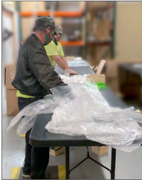
Employees at Laclede Industries in Lebanon were among those at four workshops helping a furniture manufacturer fulfill an emergency request for COVID-related PPE.

Four Missouri workshops played a critical role helping a Lebanon, Mo. furniture manufacturer produce 150,000