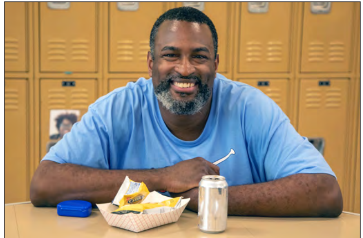
One of the 5,400 citizens working in Missouri workshops.

All people have a more fulfilling life if they are working. In Missouri, sheltered workshops provide MOre employment options for those otherwise who would not be working. Thanks for your support!