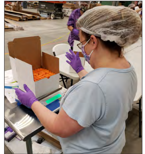
Employees at Southeast Enterprises were part of an intense effort to design and manufacture COVID testing supplies

Southeast Enterprises continues to prospect new clients. The opportunities included making, inspecting and reworking packaging materials, assembly and