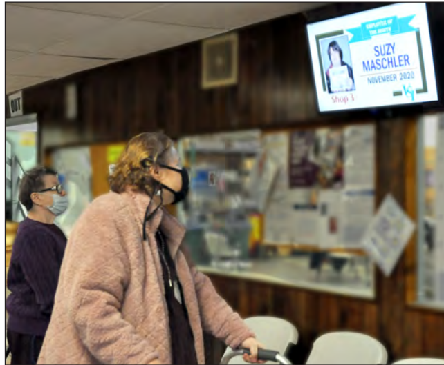
Employees at Vocational Services, Inc., in Liberty and North Kansas City can learn about everything from properly wearing a mask to recently honored coworkers with VSI TV, a network of screens that “broadcast” information at all three locations.

This year that became critical as employees came back from quarantines with